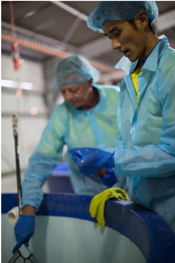
Seafarms' employees at their Founder Stock Facility inspect the condition of high health broodstock in Exmouth, Western Australia (see Figure 1 left and Figure 2 below )