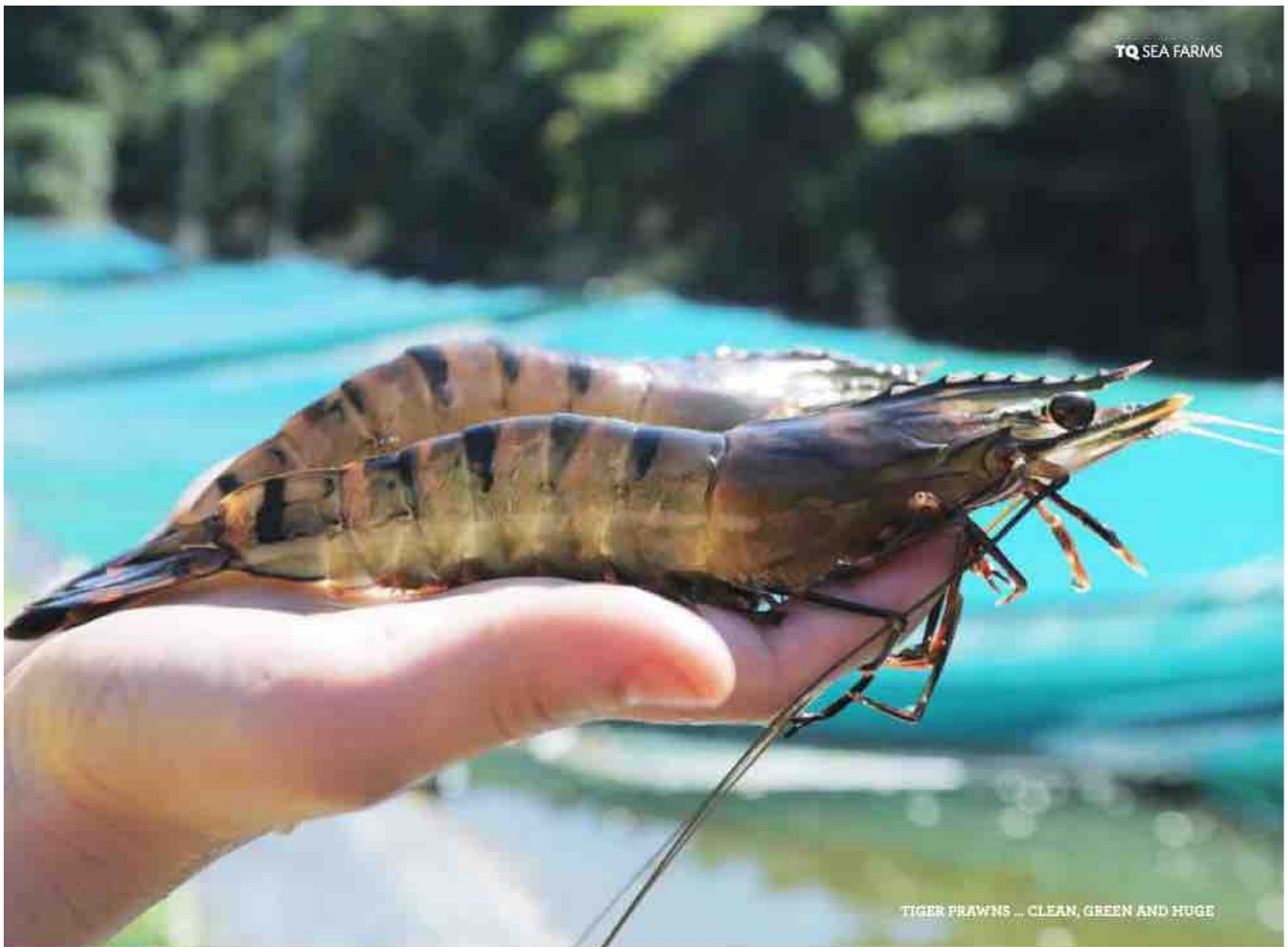
TIGER PRAWNS ... CLEAN, GREEN AND HUGE